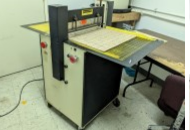
Swatch Master XL2000 20" Wide Swatch Cutter Electric Operation

Additional fee will apply to orders of less than 10 sections.