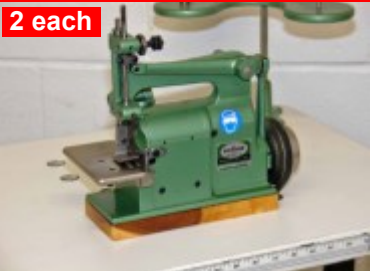
Merrow Model 18E 3 Thread Serger, Set up with Blanket Stitch Sewing Machine 3.5" Blade, Cold Cut Strip Cut Single Thread Long Stitch $2.250.00 each