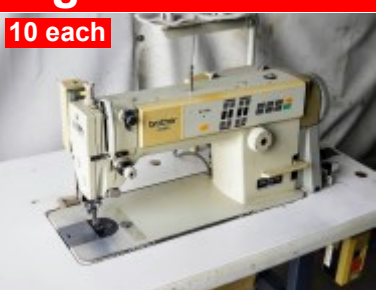
Brother Model DB2-B737 Single Needle Lock Stitch Full Automatic Functions $795.00 each