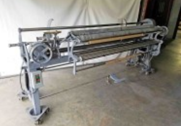
Utica Fabric Slitter Several Available For Sale Call today for more details