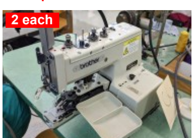
Brother Model LH4-B816 Brother Model CB3-B917 Button Sew Machine $795.00 each