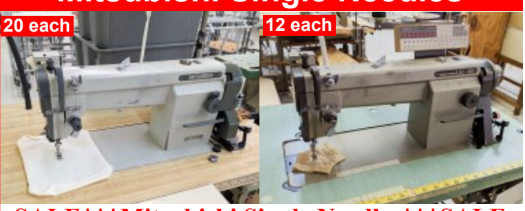
SALE***Mitsubishi Single Needles***SALE Single needle lock stitch, Full Automatic Functions, 220v, 3 ph

Mitsubishi Model LS2-1180 Mitsubishi Model LS2-180 $450.00 each