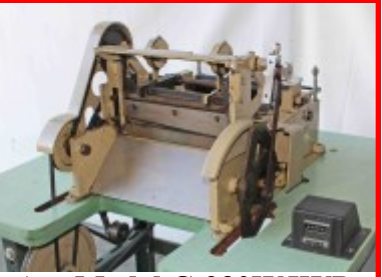
Ace Model C-230W5WP 10" Blade, Cold Cut Strip Cutter Auto Counter Shut Off $1,950.00