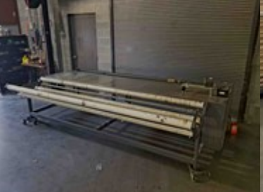
Flat Table Top Rewind Machines Cradle to Cradle Rewind, Digital Counters, Speed Control, 110 volt 60", 84", and 120" widths available