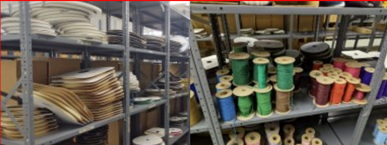
Approximately 200 each Spools of Cording Approximately 200 sets of Velcro

Most rolls are full rolls. Some partial. Email for more details. Additional loading and packing fees could apply.