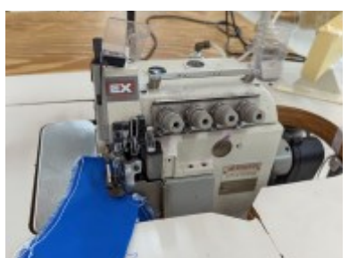
Pegasus Model EX-3215 5 Thread Safety Stitch Serger Ndl Pos, FL, Thread Trim $1,095.00