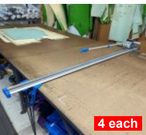
Maimin End Cutter Table Top End Cutter Adjustable to 72" Width