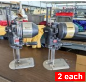
Maimin Saber Type 800 and 2000 8" Blade, 110 volt