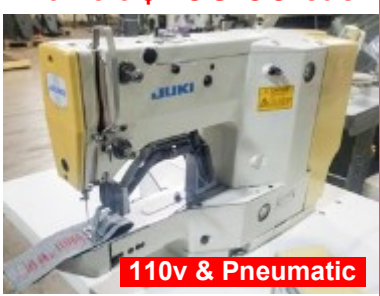
Juki Model LK-1900SA Programmable Bar Tack $2,450.00