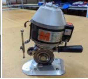
Maimin Type 54 Round Knife, 110 volt 2 each available