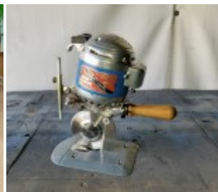
Eastman Class 355 Round Knife, 110 volt 2 each available