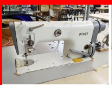
PFAFF Model 483G Single Needle Lock Stitch Full Automatic Functions $995.00