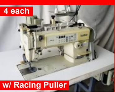
Brother Model DB2-B73 Single Needle Lock Stitch Full Automatic Functions