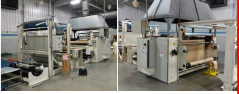
Lemaire Transfer-Printing calendar

Rollingstatic 1000/1800/HEL Model CZV, 71" working width 100% Nomex Blanket, Model Year 2004