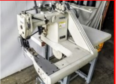
Brother Model DA-9280-1 3 Needle, Lap Seam, Set up with puller, Will sew Jeans Like New Condition