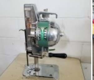
Wolf Pacer Knife 6" Blade, 110 volt Single Speed