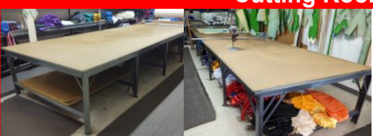
Phillocraft Cutting Table

54", 66", 72", 78", 96", and 120" Wide tables available Other sizes and New tables are available as well. Call for Details!!