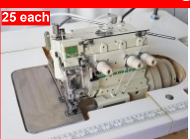
Yamato Model AZ-8003 manual or automatic functions. $895 to $1,250 each