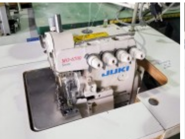
Juki Model MO-6716 5 Thread Safety Stitch Serger Complete TSM, 220v/110v