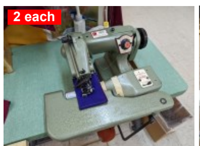
US Blindstitch Model 1118 Blind Stitch Machine w/110v $950.00 each