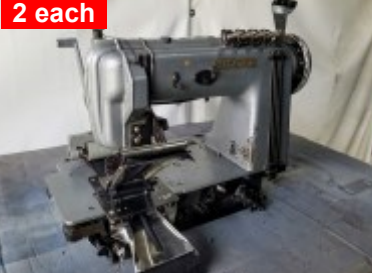
Singer Model 300W Twin Needle, Set up sewing Bands, with puller, 2 each sold as head only