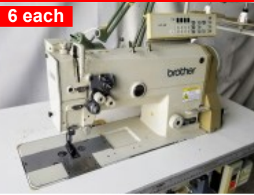
Brother Model LT2-B842 Twin Needle Lock Stitch Full Automatic Functions $1,995.00 each