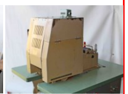
Ace Model HDN-720MP 3.5" Blade, Cold Cut Strip Cut Auto Counter Shut Off