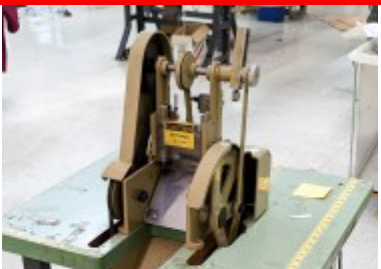
Ace Model HD-720 Mechanical Counter, 110volt $1,150.00