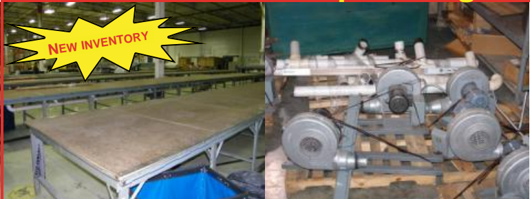
Phillocraft 72" and 84" Air Flotation Cutting Table 60 sections 72" wide, 20 sections 84" wide