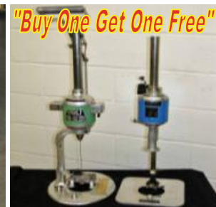
"Buy One Get One Free"

K Cappa M# 51EC 20" Pinking Blade $2,495.00