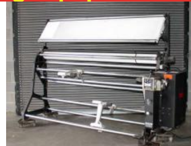
Measuregraph M#564-72 Cloth Inspection Machine