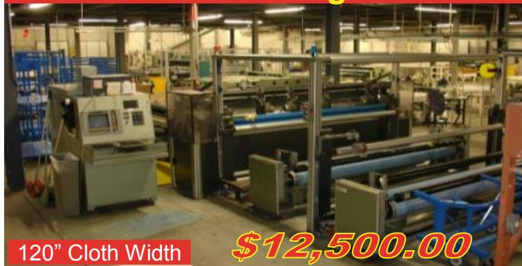
120" Cloth Width