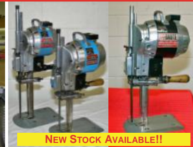
Eastman Cutting Knives Blue Streak II and Brute 110 volt and 220 volt $495.00 to $795.00