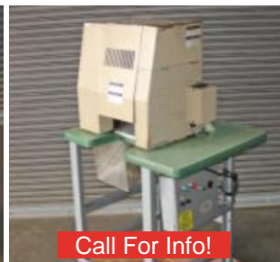
Call For Info!

Cutex Cutter 7.8" Cut, Hot or Cold $2,495.00