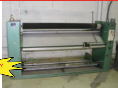
Pernick Model I-800M 78" Inspection Machine