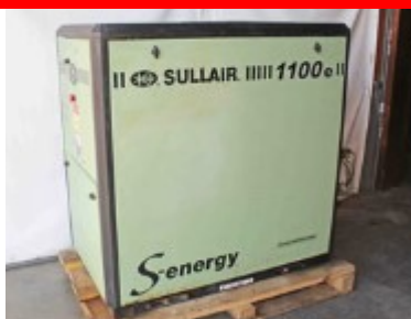
Sullair Air Compressor Model 1100E, 230 volt 3 phase 15 HP Screw Compressor $3,995.00