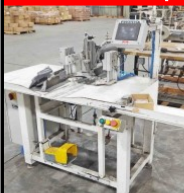
Mop Sewing Machines Texmatic Machinery Co Ontarian Sewing Automatic Programmable Mop Sewing Machines. 7 each Available. Most Complete. A few missing parts. $2,895.00 each Buy All $14,995.00