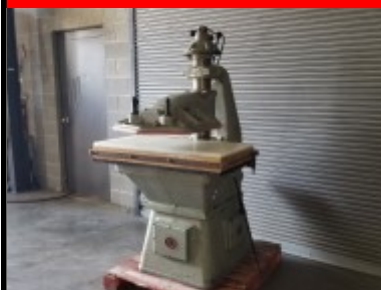
Schwabe Model D Swing Head, 20 Ton 40" Wide x 20" Deep Base $3,995.00

All equipment below is located in Lumberton, NC. New Assets have just arrived and need to sell now!!