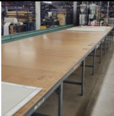
Fabric Cutting Tables 60", 66", & 78" Wide $95.00 to $150.00 per 4' section