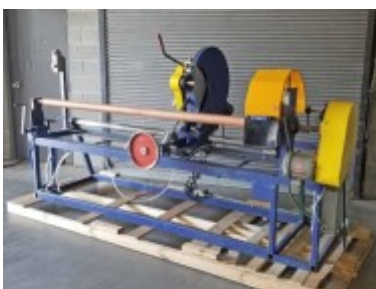
James Cash Fabric Slitter 90" Overall Length, 1-1/2" Shaft 18" Blade, Traveling Head $7,900.00