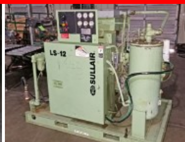
Sullair Air Compressor Model LS12, 230 volt 3 phase 50 HP Screw Compressor $4,995.00