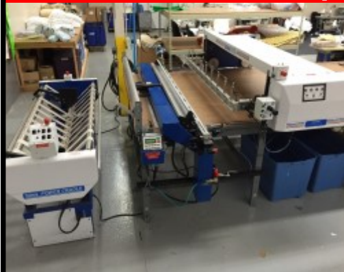
Eastman Blue Jay Pull/Cut Spreading System 66" and 120" Widths Both units include the spreading unit, end cutter, and power cradle. 66" Machine... Michigan $34,000.00 120" Machine... New York $44,000.00