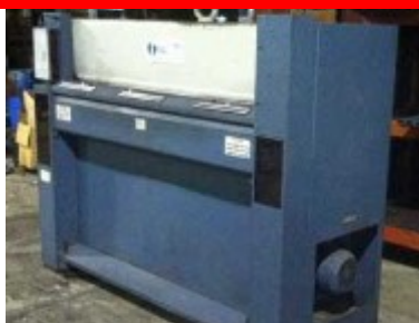
Hudson Beam Press Model S-325, 30 Ton 60" x 22" Cutting Area $4,500.00