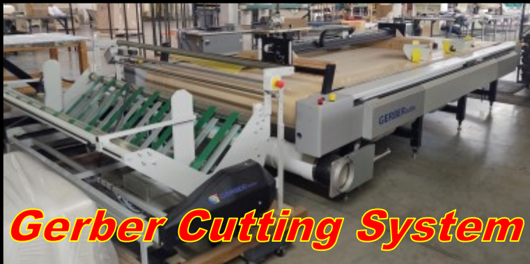
Gerber model DCS-3600 Single Ply Automatic Cutter Conveyorized Cutting System, 72" wide x 15' long conveyor. 2017 Model Year, With Feeder and Match Works Projector!

ACT NOW!! ALL ASSETS MUST BE MOVED BY MAY 26TH!!