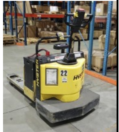
Electric Pallet Jack...3 each Toyota, Hyster, Crown 3 each to choose from