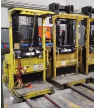
Order Pickers..12 each Hyster & Crown Models Some work/Some need repairs