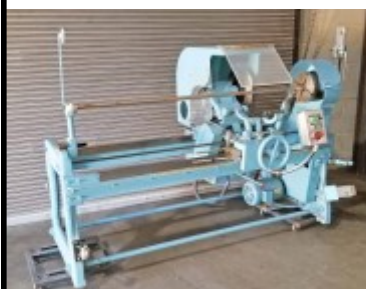
Judelshon Fabric Slitter 66" Overall Length, 1" Shaft 15" Blade, Traveling Head $6,500.00