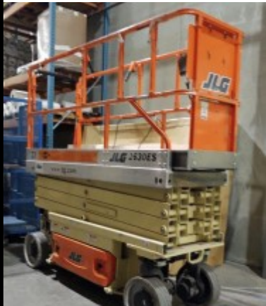
Scissor Lifts...3 each 3 each to choose from! JLG, MEC, & Up-Right