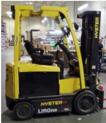
Hyster Forklifts...4 each Electric Forklifts With Chargers, 36 Volt