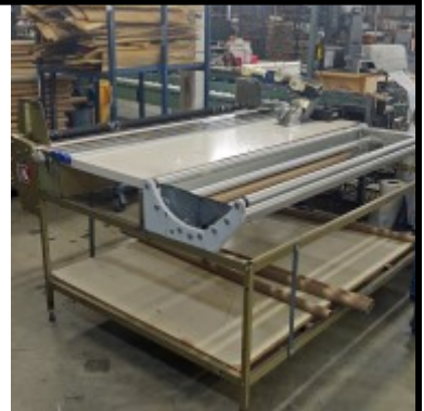
Flat Table Top Rewinders Digital Counters, Some with End Knives, 60" & 66" Width $2,950 to $3,500