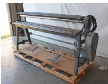
Utica Fabric Rewinder 72" Wide $2,900.00 96" Wide $4,500.00