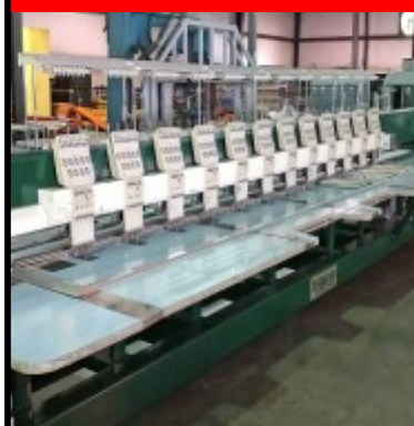
Embroidery Machine Manufactured by the Wuhan North Phenix Jiamei Computerized Embroidery Machine CO in China. 12 Sewing Heads, 9 Colors Model Number GG766-912. Set up with USB Drive Feed. $4,995.00