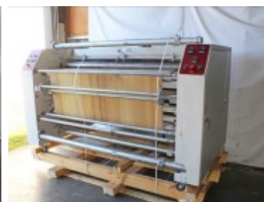
Astechnologies Model 7960T Rotary Heat Transfer Machine 64" Workable Width $9,995.00