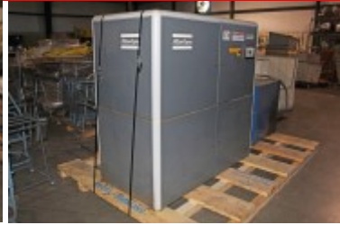
Atlas Copco Model GA30 40 HP, 230/460 volt Model Year: 1999