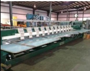
Embroidery Machine 12 Sewing Heads, 9 Colors Model GG766-912 Set up w/ USB Drive Feed