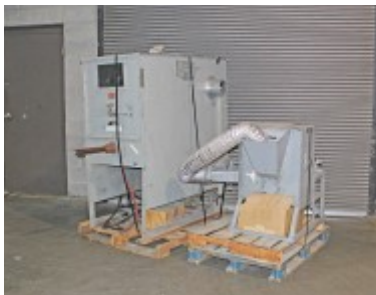
Ormont Pillow Blower Includes Blower, Feeder, & Picker Model TF-05 1 HP Motor, 220 volt 3 phase