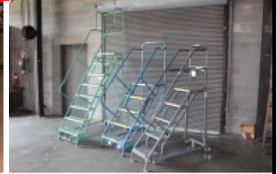
Metal Rolling Ladders 5 to 8 Step Ladders 16" to 24" Wide Steps