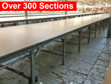
Over 300 Sections

HURRY!! BUILDING MUST BE EMPTIED BY July 26th!!