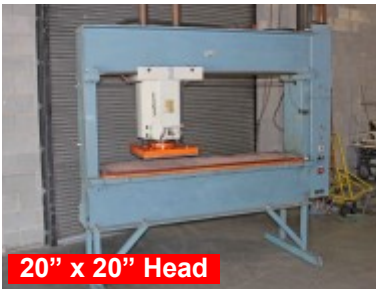
20" x 20" Head