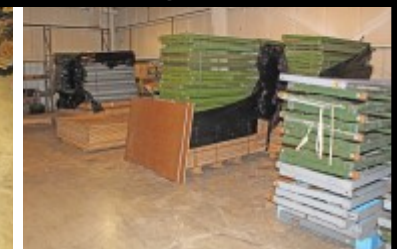
Philocraft Cutting Table, 72" width...New Stock Table condition is usable, but tables do have imperfections to include drill holes, markings, discoloration, etc. Most have green legs.