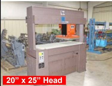
20" x 25" Head

42" x 45" x 42" Tall...60 each... $84.25 each