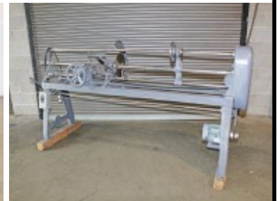
Utica Fabric Roll Slitter 81" Overall Fabric Width 12" Blade, 1" Shaft, 45" Right of Blade, 36" Left of Blade, 220 volt