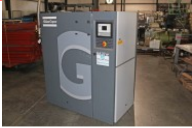
Atlas Copco Model GA37 50 HP, 460 volt, Year: 2011 Includes built in Air Dryer