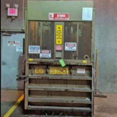
Selco Model V5-HD 60" Wide x 30" Deep 220 volt 3 phase