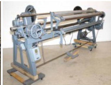
Utica Fabric Roll Slitter 90" Overall Fabric Width 15" Blade, 1.5" Shaft, 66" Rewinder, 220 volt