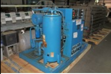
Quincy Air Compressor 50 Hp, 230/460 v Includes tank & air chiller

All equipment below is located in Lumberton, NC. New Assets have just arrived and need to sell now!!