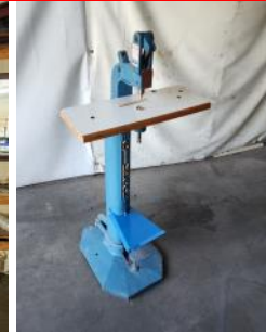
Stimpson Model 489 Style Kick Press $450.00