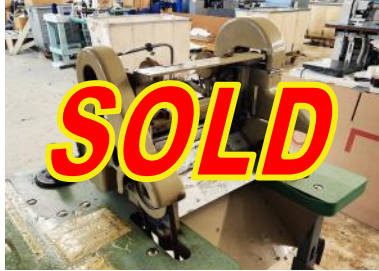
ACE Strip Cutter 12" Wide Strip Cutter $500.00