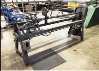
Utica Fabric Slitter 68" Overall Length, 18" to left of Blade, 12" Blade, 1" Shaft $2,000.00