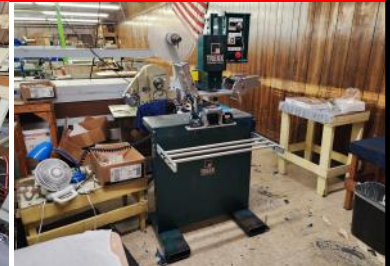
Trekk Heat Press Roll to Roll Label Application $1,995.00