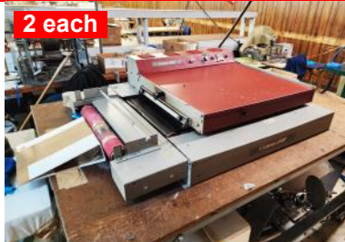
Astex Model 2100 Conveyor Belt Fusing Machine $785.00 each