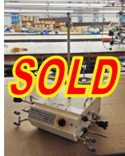
Hashima Thread Winder Model HW-40 $75.00