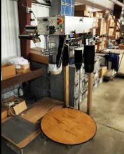
EuroCollarette Model 200-CS Auto Bias Cutter $495.00