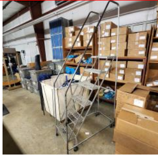
Rolling Ladder 6 Step With Wheels $95.00 each