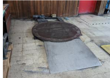
Drive On Turn Table Used to Shrink Wrap Pallets $750.00