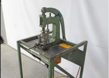
Handy Button Press Button Cover Press Manual $350.00 Pneumatic $650.00