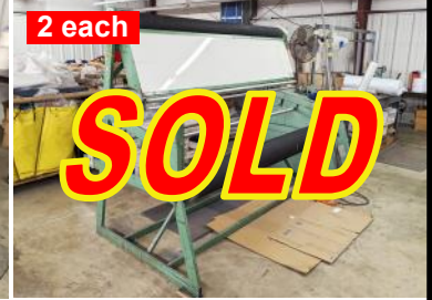
Sunco Inspection Machine Fabric Width 72" With Inspection Light $1,900.00 each