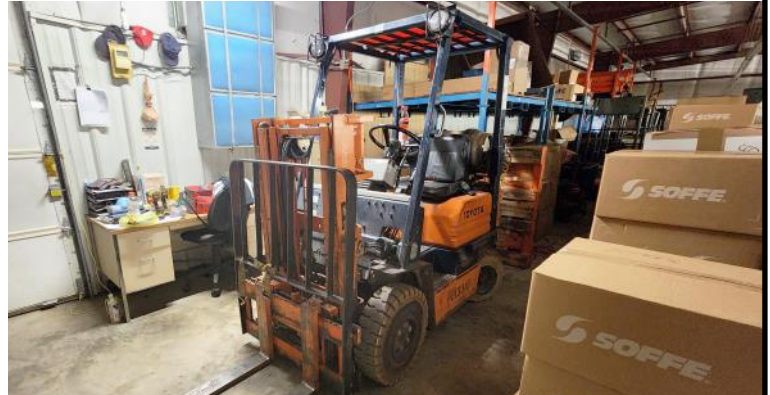
Toyota Model 42-5FG10 LP Gas Forklift 2,000 lb Capacity $3,995.00

T&T Liquidators is currently liquidating the assets of the former Craig Industries facility in Lamar, SC. All assets need to be sold and moved by October 20th, 2022.