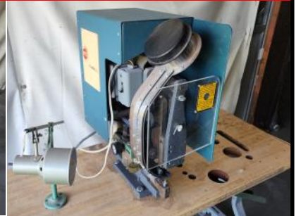
PCI Group Grommet Setting Machine #0 or #1 Size Grommet, 110v $1,850.00