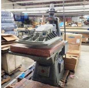
Schwabe Die Press Hydraulic, Model D 20 Ton, Swing Head $2,200.00