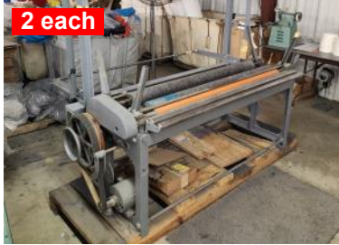
Utica Side Slitter Slits Tubular Fabric into Open Width, 48" Fabric Width $600.00 each