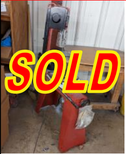
Amrox Metal Bandsaw Model WB-600 $95.00