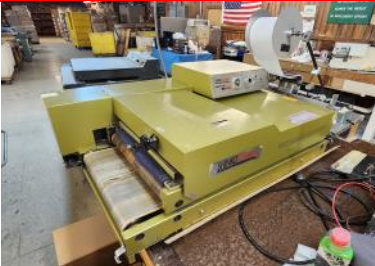
Shinko Summit Mini Press Conveyor Belt Fusing Machine $785.00