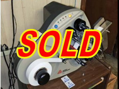
AVERY Model SNAP 500 Fabric Label Thermal Printer 110 volt...Excellent Condition $4,950.00