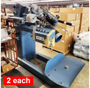
Artex Bias Cutter Model MTK-FYSR-40 Multiple Blades $695.00 each