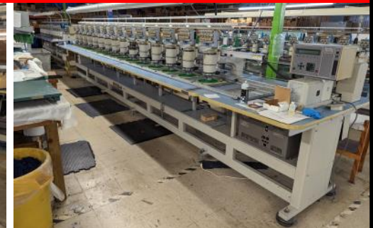
Barudan 12 Head (1 each) and 15 Head (6 each) Embroidery Machines Five each in working condition...Two each for parts. Includes machines, pneumatic frame loaders, frames, supplies and more. Call to discuss machines and interest. Prefer to sell all to one buyer, will listen to all offers and inquiries.