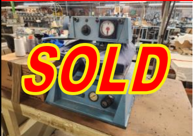
Insta Heat Press 15" x 15", Pneumatic Press $450.00