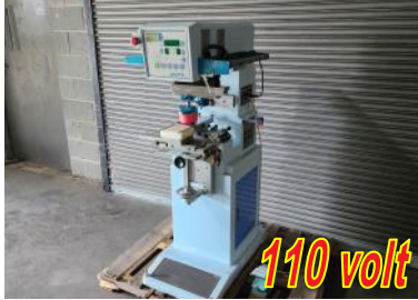
InkCups Pad Printer Model ICN-2200-PSX 2 Color Automatic Pad Printer Reduced $1,995.00 110 volt