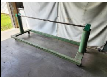
Single Roll Fabric Rack