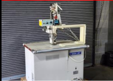
Queen Light Fabric Welder Fabric Welding Machine Set up with a 45MM Wheel Width $3,995.00