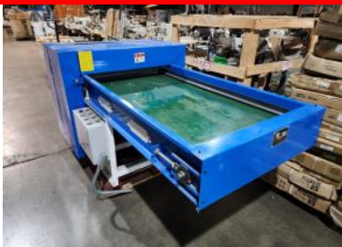
Zhengzhou Runshi Compression Machine Pillow Press Machine with Sealer