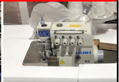
Juki Model MO-6816S Five Thread 2-Needle Safety Stitch Serger set up for Medium to Heavy Weight Material.