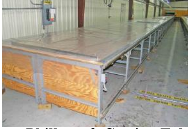
Phillocraft Cutting Table Good Usable Condition

66" Width $145.00 each 78" Width $165.00 each