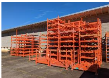
Dyna Rack Metal Stack Racks 60" x 60" x 48" Tall, 4,000 lb Capacity 22 each with Wire Mesh Bottoms. 36 each without Bottoms New Price from Dyna Rack over $400.00 each Price 1-25 each: $175.00 each Price 26-50 each: $150.00 each Buy All 58 Stack Racks $7,800.00