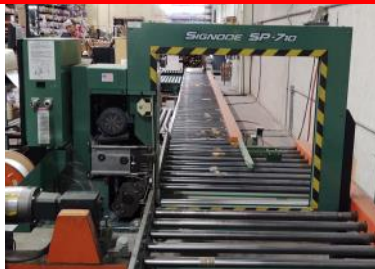
Signode Strapping Machines Two each Model SP-710 Automatic In-Line Strapping Machines Size: 72" x 48" & 32" x 36" * Conveyor Not Included * $2,450.00 each or Buy All for $5,995.00