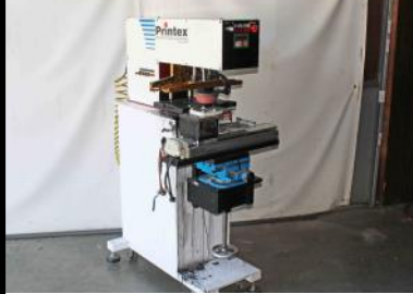
Printex Pad Printer Model COS-115 3 Color Automatic Pad Printer Reduced $1,995.00