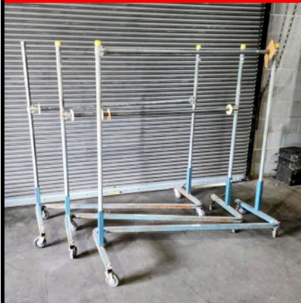
Z-Racks and Straight Racks Over 50 each Rolling Z-Racks Reduced $49.00 each Over 50 each Rolling Straight Racks Reduced $25.00 each Buy All Racks $2,995.00