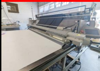
Gerber Automatic Spreader Model XLS125, Model Year 2015 Up to 90" Spreading Width Reduced $16,500.00