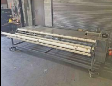
Flat Table Top Rewind Machines

Cradle to Cradle Rewind, Digital Counters, Speed Control, 110 volt