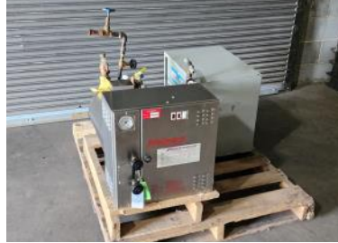
Reimers Boiler Model R-18 Selling AS IS Reduced $495.00