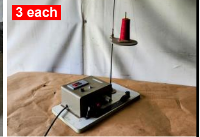
Baruden Thread Winder Wind from Cones to Bobbins $95.00 each 3 each