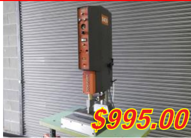
Reece/Branson Model 8400 Table Top Ultrasonic Sealer $1,795.00 $995.00