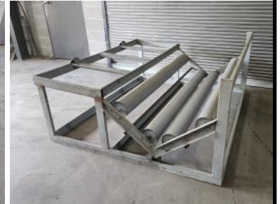
Heavy Duty Fabric Cradle