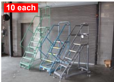
10 each Metal Step Ladders Many to Choose From Reduced To $95.00 - $250.00 each