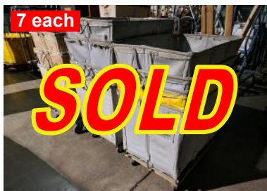
SOLD Dandux Hamper Canvas & Vinyl Hampers 10/12 Bushel Usable condition Buy All $300.00