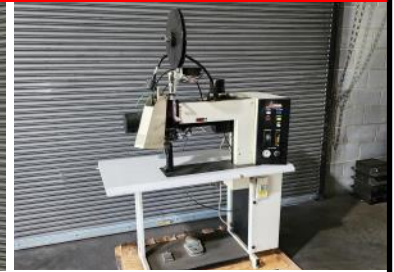
Ardmel Model MK501 Hot Tape Seam Sealer Reduced $1,850.00