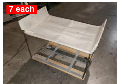
7 each Vinyl Work Aids 24" Wide x 18" Deep x 18" Tall Buy All $140.00