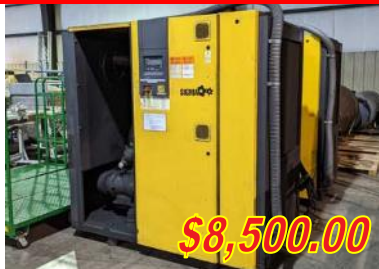
Kaeser Model CSD-100 100 HP Screw Air Compressor 2007 model year, 460v, 3 phase $9,950.00 $8,500.00