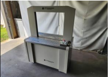
Plastic Strapping Machine 28" Tall x 24" Wide Strapping Area Reduced $795.00