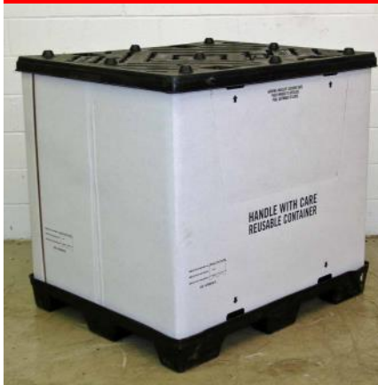
Uni-Pak Shipping Container with New Sleeves 40" x 48" x 45" Tall. Sleeves available with or without drop down door. Used tops and bottoms, with new sleeves. Quantity of 50-100 each Price: $112.00 each Quantity of 100+ each Price: $92.00 each

Call John-Paul or Gerald Deaver 910-608-4005!!