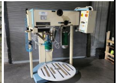
AMP Pisani Bias Unit

Model TPM/1000 Automatic Collarlette Cutter