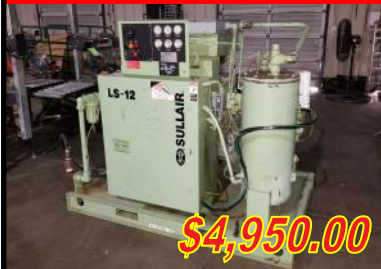
Sullair Air Compressor Model LS12 50 HP Screw Compressor $5,500.00 $4,950.00