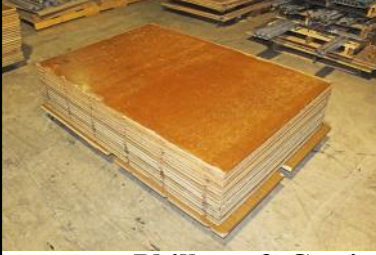
Phillocraft Cutting Table, 72" width

Table condition is usable, but tables do have imperfections to include drill holes, markings, discoloration, etc. Most have green legs.