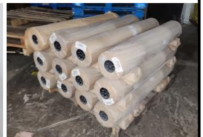
Plotter Paper Rolls

48" Kraft Plotter Paper Approximately 600ft per roll Buy All $450.00