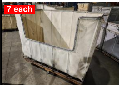
7 each Dandux Canvas Hamper 60" x 30" x 44" Deep Inside 40" x 20" Window $75.00 each Buy All $375.00