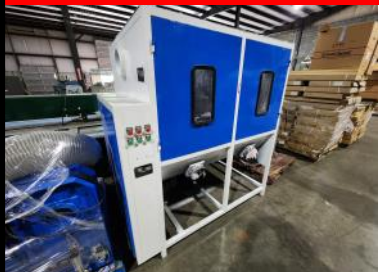
Zhengzhou Runshi Pillow Blower Includes Fiber Opening Machine, Suction Fan, Mixer Silo, and 2 Fiber Filling Blowers