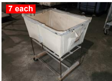
7 each Dandux Canvas Hamper 3 Bushel. 26" x 17" x 14" Deep Buy All $200.00