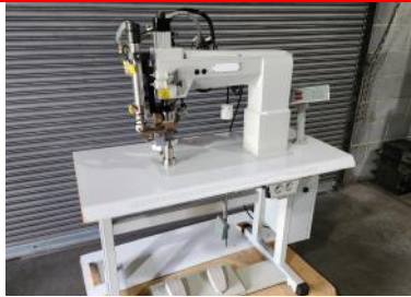
Fabric Welding Machine Set up with a 25MM Wheel Width $1,995.00 each