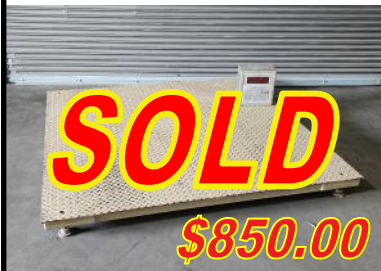
SOLD $850.00 B-Tek BT840 Digital Scale 60" x 60" Platform With 2 each 36" Long Ramps Original Retail $2,800.00 $1,495.00