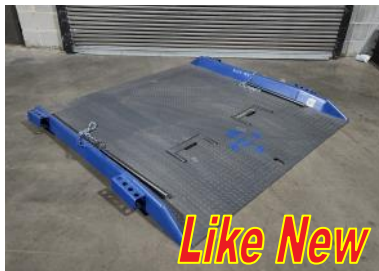
Like New Heavy Duty Dock Plate 72" Long x 72" Wide 15,000 lbs. capacity Original Retail $2,650.00 Reduced $1,250.00