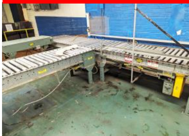
Hytrol Motorized Conveyor 26" wide overall, 23" wide rollers, Approximately 330 overall feet. Includes Panel Box, 220v, 3 phase. Also 40' of 34" wide conveyor