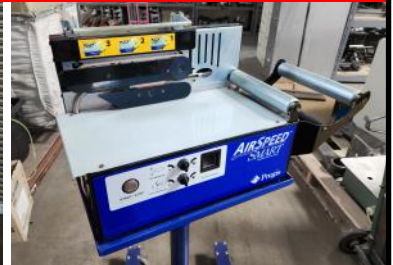
Pregis AirSpeed Smart Inflatable Packaging Machine Reduced To $695.00