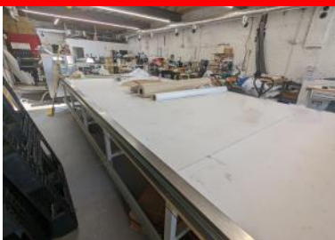
Gerber Air Flotation Cutting Table 96" Wide x 40' Long Table Reduced $5,995.00