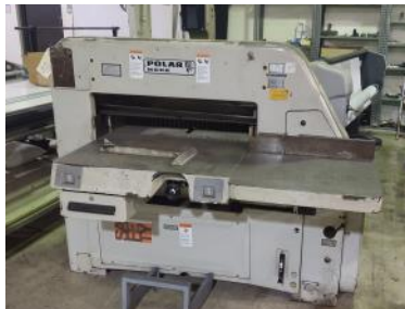
Polar Mohr Guillotine Paper Cutter

Model 82ST, 32" blade width 220 volt, Working Condition. Selling AS IS. Call for Details.