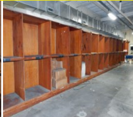
Wood Shelving Lots to Choose From Call/Email for Details