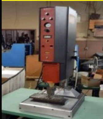
Reece/Branson 8400 Ultrasonic Sealer $2,495.00