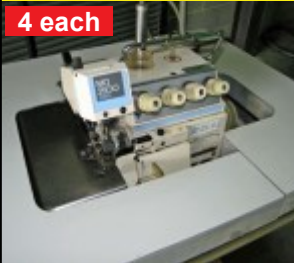
4 each Juki MO-2516N 5 Thread Serger $695.00 each