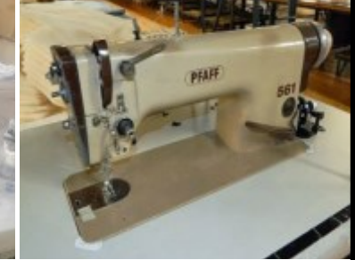
PFAFF Model 561 SN, Needle Feed, Ergo Stand $495.00