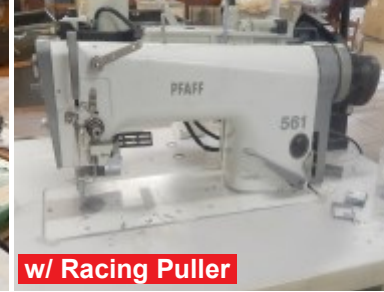
w/ Racing Puller PFAFF Model 561 SN, Needle Feed, Ergo Stand $845.00