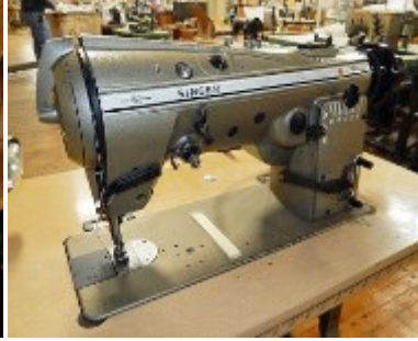
Singer Model 457U Single Needle, Zig Zag $745.00