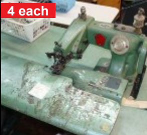
4 each US Blindstitch Model 99, 718, & 518 $150.00 each