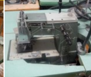
K.S. DFB-1402P 2 Needle, 3" Gauge $745.00