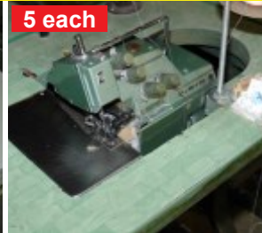
5 each Yamato Z361 5 Thread Serger $150.00 each