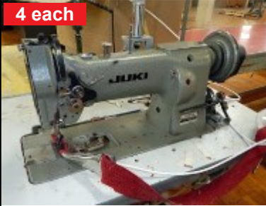
4 each Juki Model LU-563 Single Needle Walking Foot $850.00 each