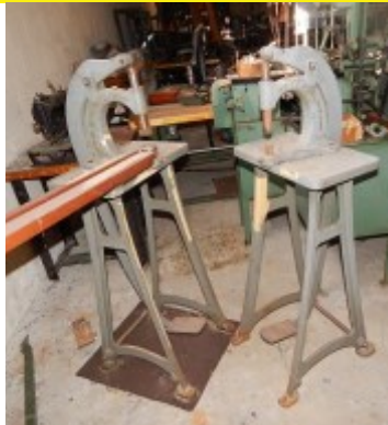
Manual Kick Press Several to Choose From $245.00 each