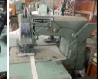
K.S. DFB-1412P 12 Needle, 1/4" Gauge $945.00