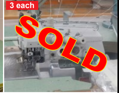
3 each W & G 515-ETB 5 Thread Front & Rear Top Feed $595.00 each