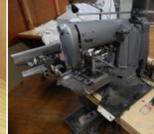
Singer 269 Drapery Pleater $495.00 each