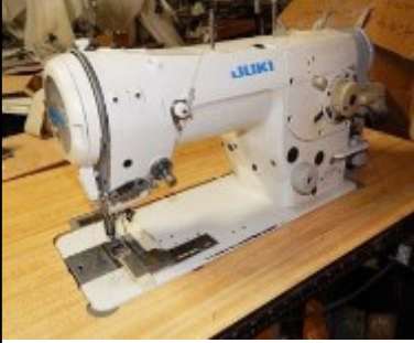
Juki Model LZ-2288 Single Needle, Zig Zag $1,450.00