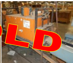
Shanklin L-Sealer & Shrink Tunnel Tunnel may need heating elements Buy Both $995.00