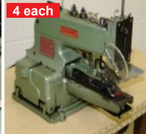
4 each Lewis 200-1 Button Sew Machine $150.00 each