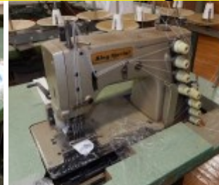
King Special DTN-430 4 Needle w/ puller $495.00