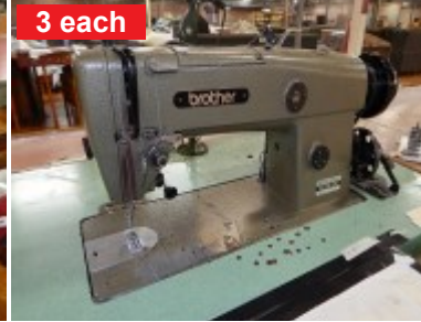
3 each Brother Model DB2-B791 Single Needle, Needle Feed $595.00 each