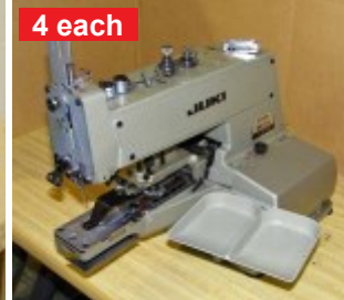
4 each Juki MB-373 Button Sew, Head Only $600.00 each