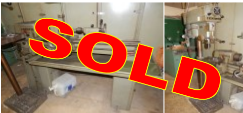
Shop Equipment Includes Lathe, Drills, Vise, Pipe Threaders, Saws, Grinders, & More. Call/Email for Details