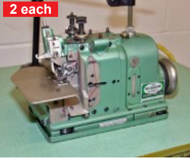
2 each Merrow MG-2DNR-1 Purl Stitch, Serger $825.00 each