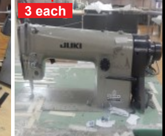
3 each Juki DLN-415 SN, Needle Feed $295.00 each

Lots of Vintage Sewing Machines to Include Singer Model 151W1, Singer Model 400W1, Singer Model 112W & 212W, Singer Model 253W211 Rufflers, and original WOOD sewing tables!! Call For Details!!