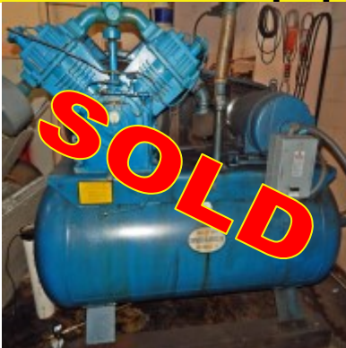
GE Air Compressor 25 HP, Piston $2,495.00