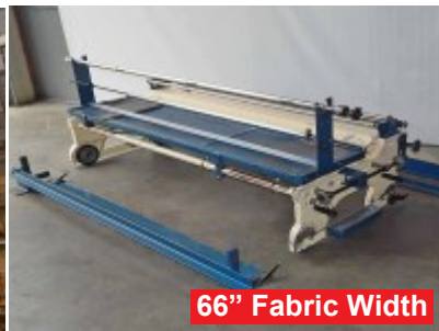
66" Fabric Width

Manual Fabric Roll Hoist 1 ton lift w/ Frame for 120"+ rolls $250.00 each