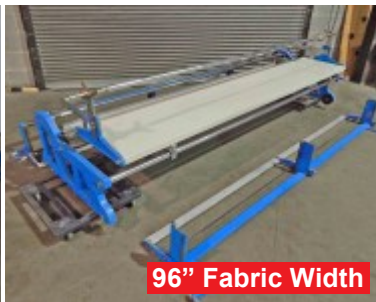
96" Fabric Width

Cutline Mustang Spreader w/ End Catchers $1,995.00