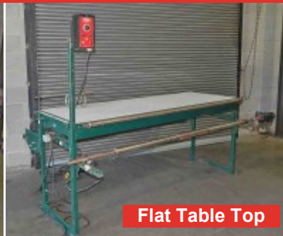
Flat Table Top

Motorized Rewind/Unwind Frame w/ Yardage Counter $2,250.00