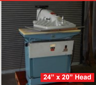
24" x 20" Head

Inspection Machine 72" Fabric Width, 110 volt $2,495.00